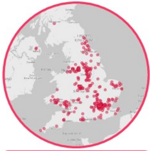
This map shows Scholars Programme placements in Spring 2018/19

Congratulations to our Brilliant Club students of 2019.